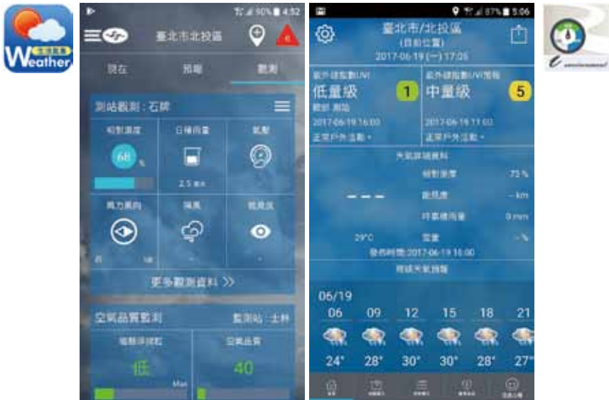
↑ Air quality monitoring data and weather forecasts are synchronized on both the EPA and CWB's apps.

The signing of the cooperation agreements will magnify the effect of information sharing and exchange between the EPA and CWB. Other than improving the efficiency of dynamic air quality forecast modelling and the use of remote sensing for environmental monitoring, the agreement will allow exchanges of marine and land weather monitoring data and forecasting information. The EPA expects that the agreement will make the best use of the observatory information obtained by both parties and accelerate the application of environmental forecasting data.