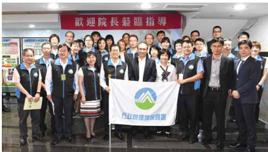
➡ Premier Lin Chuan (front row, center), EPA minister Ying-yuan Lee (front row, fourth from the left) and personnel of the Toxic and Chemical Substances Bureau

To show its determination to control chemical substances at the source, the Toxic and Chemical Substances Bureau started promoting the Investigation and Guidance Plan for the Chemical Raw Material Industry from February 2017 and started the implementation on more than 2,000 businesses in May. The Toxic and Chemical Substances Bureau began the plan from establishing a basic database for toxic chemical substances, and accompanied it with four supporting guidance strategies including: investigating the flow of chemical substances, asking the buyers' usage of the