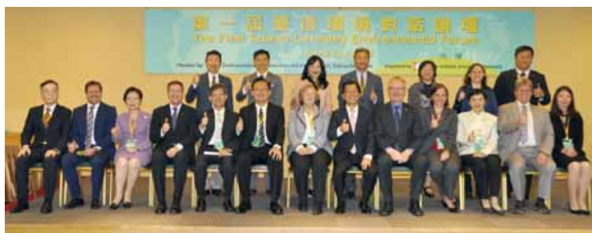
↑ EPA Minister Ying-Yuan Lee (front, sixth from right) and the invited experts of the First Taiwan-Germany Environmental Forum

On the topic of a circular economy, other experts from Germany presented the status of Germany's promotion of resource efficiency and bioenergy, setting the foundation of future cooperation between the two nations in a circular economy. Experts from Germany also shared measures adopted by German corporations and citizens to take part in environmental protection. Many such measures will help Taiwan to build its own public participation mechanisms.