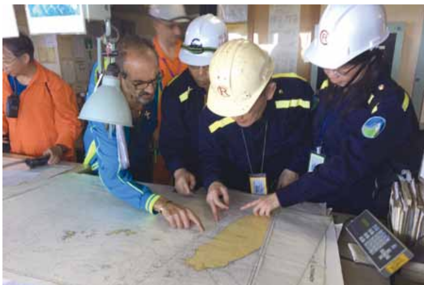
➡ Taiwan officials examine the suspected vessel's navigation path with an inspector of the Australian Maritime Safety Authority (first on left).

To find those responsible for the oil spill, the EPA actively traced the navigation routes of various vessels since the incident occurred on 10 March. By combining the MOTC's data from an automatic identification system (AIS) with information from marine experts and local diving instructors on Green Island, they learned that one suspected vessel was to soon dock in the Australian port of Esperance.